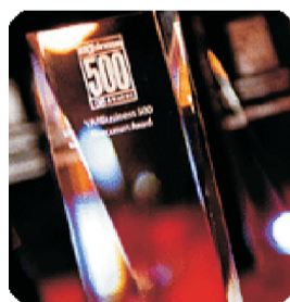
Top Technology Practices Award